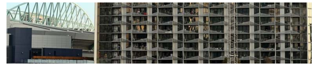
Lacrosse building's 2014 fire was exacerbated by its flammable cladding.